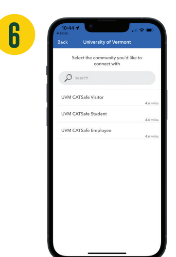
Choose Community Visitor, Student or Employee