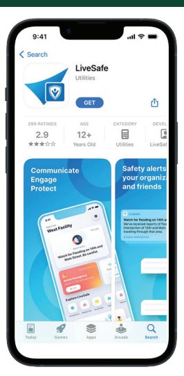
Download LiveSafe App Store or Google Play