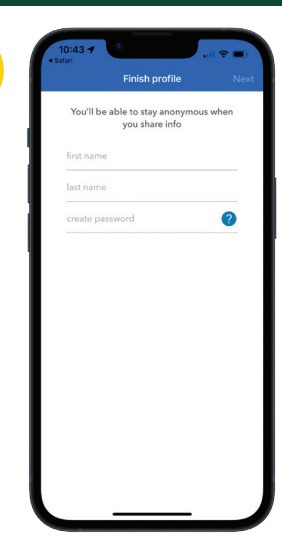
Finish LiveSafe Profile Do not use your UVM password for profile set-up