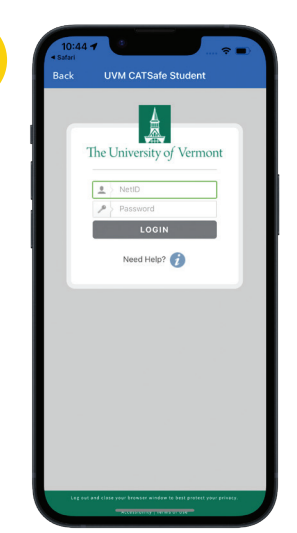
Input UVM Credentials Required for Student and Employee Communities