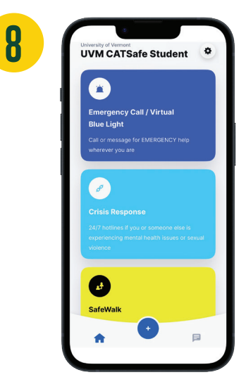
Welcome to CATSafe! If you see UVM CATSafe in the upper left you are all set!