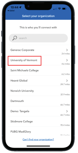
Search for and Select Univeristy of Vermont