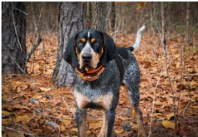
Blue Tick Coonhound