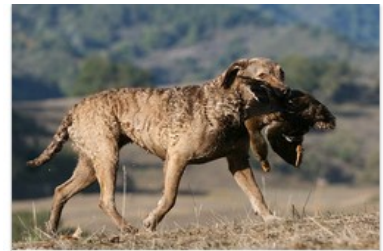
Chesapeake Bay Retriever