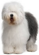
Old English Sheepdog

Herding Group: In 1983 the Herding group broke off from the Working group of dog breeds. These dogs are instinctual at gathering, herding and protecting livestock such as cows and sheep. They are naturally intelligent and responsive to being trained to do specific jobs and work closely with their human counterparts. German Shepherds are part of this group and are commonly trained for police and protection work. Some other breeds in this group that you might recognize are: Border Collies and the Shetland Sheepdog (Sheltie).