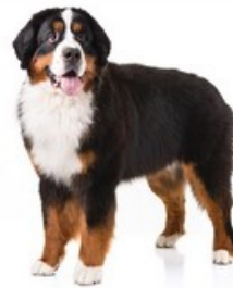
Bernese Mountain Dog