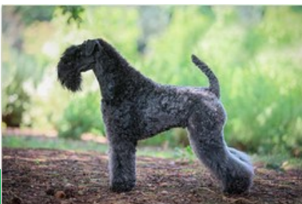
Kerry Blue Terrier