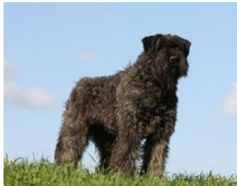
Bouvier des Flandres