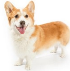
Pembroke Welsh Corgi