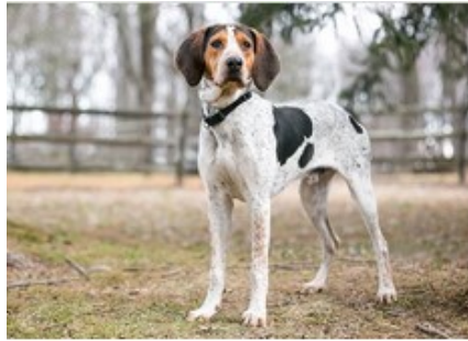
Treeing Walker Coonhound