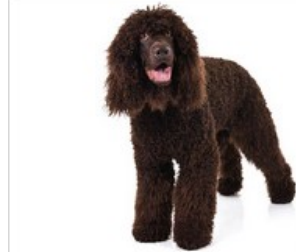
Irish Water Spaniel