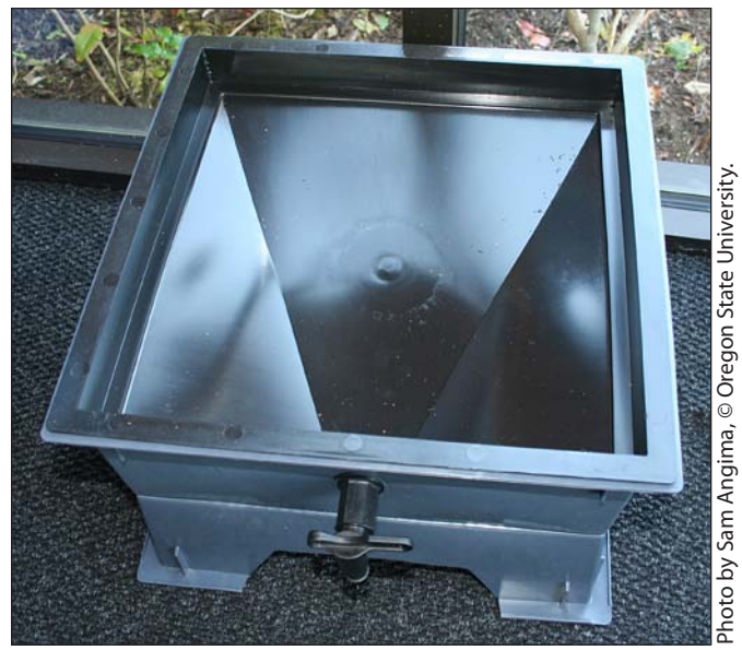
Figure 10. The bottom of a stacking tray system is designed to capture leachate and allow its easy removal with a spout.