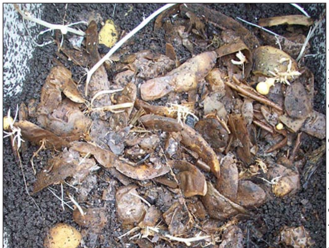
Figure 18. Because worms don't digest seeds, you may get volunteer seedlings, especially if the bin is left for a while without active feeding (such as when you are preparing to harvest vermicast).

• Anaerobic bacteria caused by poor drainage, especially if holes at the bottom of the bin are clogged. If there is too much moisture in the