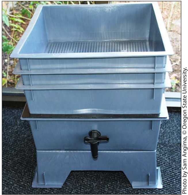
Figure 8. A commercial stacking tray system. Starting from the bottom, a series of trays are filled sequentially with food. As worms move upwards to fresh bedding and food, vermicast can be harvested from the bottom trays.

If you paint the outside of your bin, leave the inside unpainted. White paint on the outside of the bin helps reflect light, keeping the worm bin cool in summer.