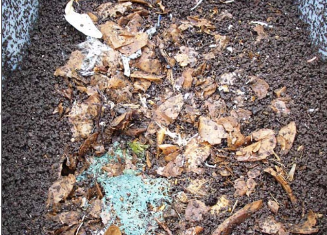
Figure 14. In this finished vermicast, you can see that the worms did not consume the potato peels. Whenever possible, avoid putting potato peels in the worm bin. They contribute to anaerobic conditions in the bin. (The greenish material is colored paper towel, which worms do consume.)