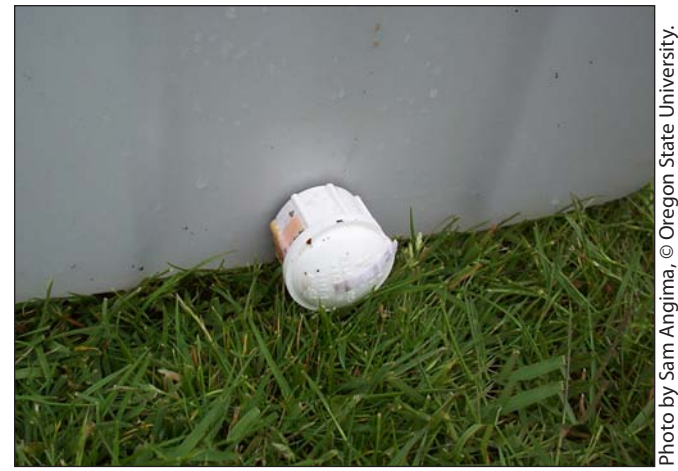
Figure 7. You can install a drain plug on the second bin to make it easier to drain leachate.