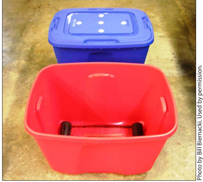
Figure 3. In a vermicomposting system, leachate collects in the bottom plastic tote. Note the two plastic blocks set inside the bottom that help prevent the two totes from sticking to one another. This makes it easier to separate them for maintenance and cleaning.

Figure 2. Vermicomposting bin system showing arrangement of two plastic totes stacked together. The first tote (the top one) is the vermicomposting bin. It has the ventilation holes and is the one that houses the worms.