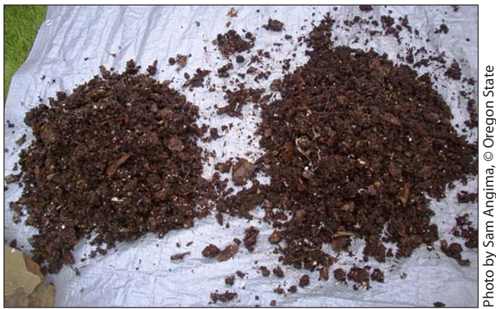
Figure 16. The first step in the "dump and sort" method for harvesting vermicast. On a tarp in the sun or under a bright light, divide the contents of the bin into small, cone-shape piles.

Move the worm bin contents to one side of the bin so it fills about <sup>3</sup>/<sub>4</sub> of the bin's volume. Add fresh bedding and food to the empty section. Let the new section stand for 2 to 4 weeks without adding fresh food to the old section.