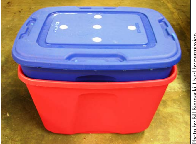
Figure 2. Vermicomposting bin system showing arrangement of two plastic totes stacked together. The first tote (the top one) is the vermicomposting bin. It has the ventilation holes and is the one that houses the worms.

To build this system, choose two sturdy, opaque plastic totes (with tops) of the same size (14-gallon is a good size to start with). The first tote is the vermicomposting bin (or worm bin) (figure 2). It nests inside the second tote, which collects any leachate (liquid residue) (figure 3) from the composting process. Note the spacers at the bottom