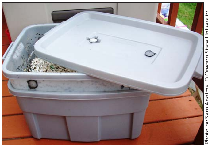
Figure 1. Two 14-gallon plastic totes, modified to make a worm compost bin. Notice the ventilation holes lined with fine mesh screen to prevent small flies from getting in and worms from getting out.

A 14-gallon worm bin measuring 1 foot deep by 1 foot wide by 2 feet long (1' \times 1' \times 2') gives you 2 cubic feet of volume, space for 2 to 2½ pounds of worms (see figure 1). A system this size can process 2 pounds of kitchen waste per week, approximately what the average family of two or three produces. A family of four to six would need a larger bin— 6 cubic feet (1' deep x 2' wide x 3' long)—and more