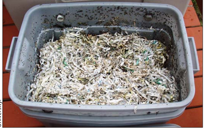
Figure 13. Always keep a 2-inch layer of fresh bedding over the worms and food in your bin.