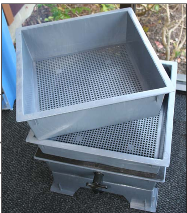
Figure 9. The trays in a stacking system are removable and have holes large enough to allow worms to move freely from one tray to the next.

Figure 8. A commercial stacking tray system. Starting from the bottom, a series of trays are filled sequentially with food. As worms move upwards to fresh bedding and food, vermicast can be harvested from the bottom trays.