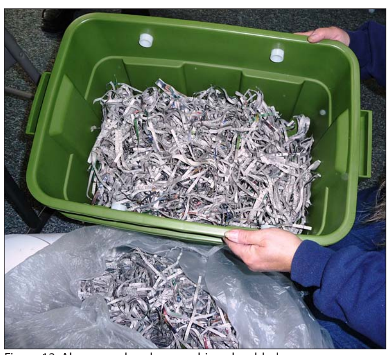
Figure 12. Always use hand- or machine-shredded newspaper or recycled printer paper. Do not use glossy paper or cross-cut shredded paper.