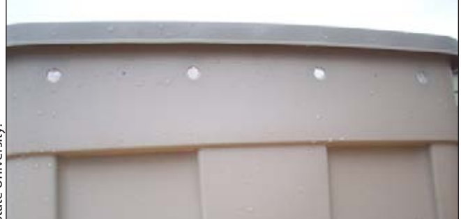
Figure 6. If commercial vents are not available, drill up to 10 ¼-inch holes on the sides, 2 to 3 inches below the lip of the tote. You can glue screen material to the holes to prevent fruit flies from invading the system.