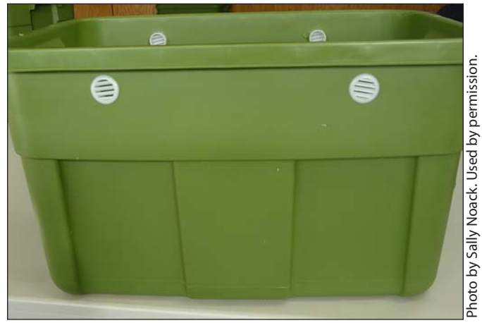
Figure 5. Commercial vents fit into 1-inch holes.

Figure 4. Drill up to 20 ¼-inch drainage holes in the bottom of the first tote. Notice that most of the holes are drilled in what are the lowest places on the tote's bottom. Leachate drains down to the lowest areas and out, so it won't stagnate in the worm bin.