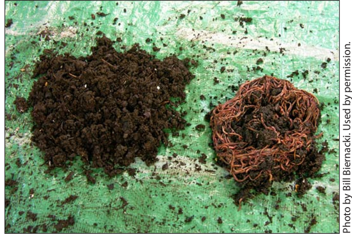
Figure 17. The pile on the right shows the last step in the "dump and sort" method, in which only the worms remain. The pile on the left has not been harvested.