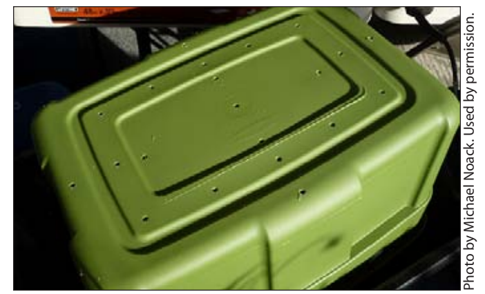
Figure 4. Drill up to 20 ¼-inch drainage holes in the bottom of the first tote. Notice that most of the holes are drilled in what are the lowest places on the tote's bottom. Leachate drains down to the lowest areas and out, so it won't stagnate in the worm bin.

The stacking tray system operates on the fact that worms follow food. Put bedding and worms in the bottom tray along with food scraps (figure 8, page 5). Once the food scraps are converted to compost, the worms look for a new source of food. Stack a new tray of fresh bedding and food scraps on top of the first tray. The worms wriggle their way through small holes in the bottom of the top tray (figure 9, page 5) to get to the food above. You harvest the compost in the first tray, and keep stacking new trays on top. Most have a drainage tray (figure 10, page 5) at the very bottom to collect leachate.