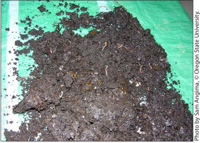
Figure 15. Vermicast is a mixture of worm castings and decomposed organic matter.

Vermicompost or vermicast is a mixture of worm castings and decomposed organic matter (figure 15). It can be very wet at harvest time depending on the kitchen waste you use (for example, lots of banana and fruit peels). If you wish to use a sieve to make debris-free compost, then allow the vermicast to dry first.